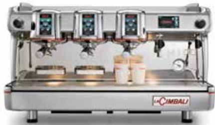
Colour: polished Aluminium