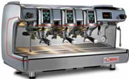
Colour: polished Aluminium