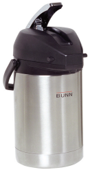
AIRPOT, 2.5L SST LA 6/ CASE