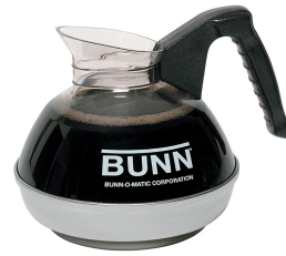
EASY POUR®,(BLK) 6/CS