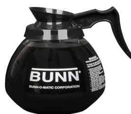
DECANTER, GLASS-BLK 12C 24/CS