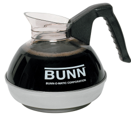
EASY POUR®,(BLK) 6-1/CS