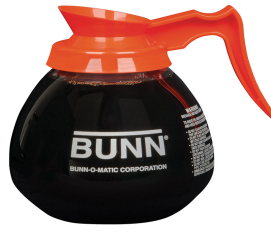
DECANTER, GLASS-ORN 12C 24/CS