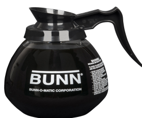
DECANTER, GLASS-BLK 12CUP 1PK