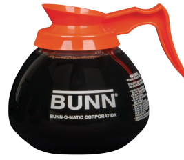
DECANTER, GLASS-ORN 12C 3/CS