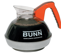
EASY POUR®,(ORN) 2/CS